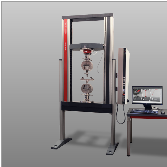
ZwickRoell Z100 modernized with testControl II