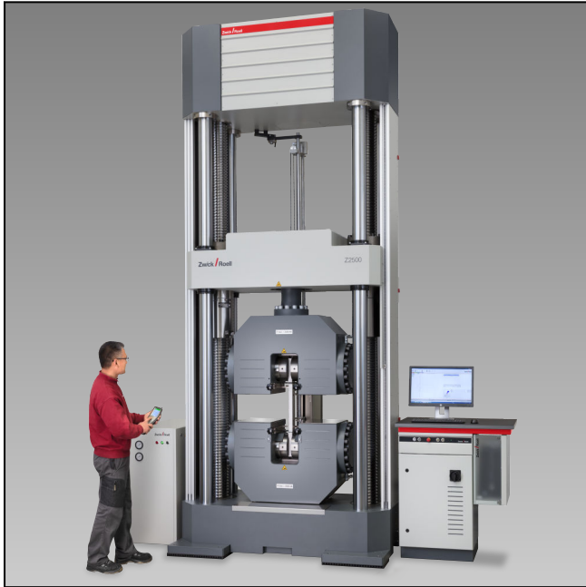
Z2500E with hydraulic grips